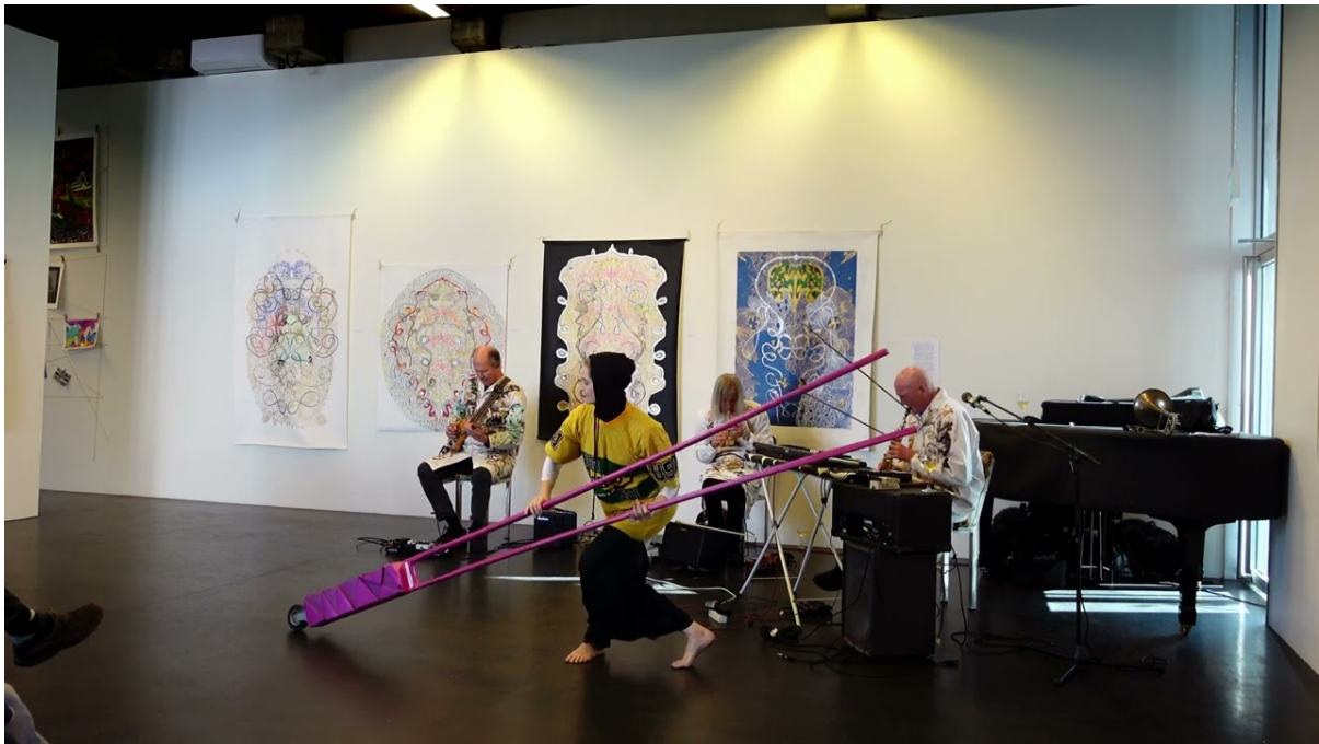
The Panda Breeding Diary. September 2025

To conclude why Self-Organization is a path forward: “A new level of complexity is reached when we take the self-organising human mind as the individual agent interacting with large numbers of other human minds in societies and with the non-human environment, which leads to many more degrees of freedom in what self-organisation can accomplish.”( Camazine)