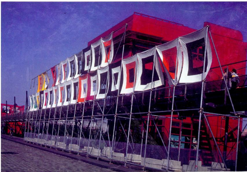
Parc de la Villette Paris France 1992

500 meter installation to trigger Event Architecture & Social Sustainability