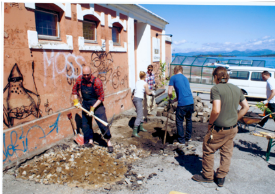
Tou Camp 2011 Bio Remediation Tou Scene