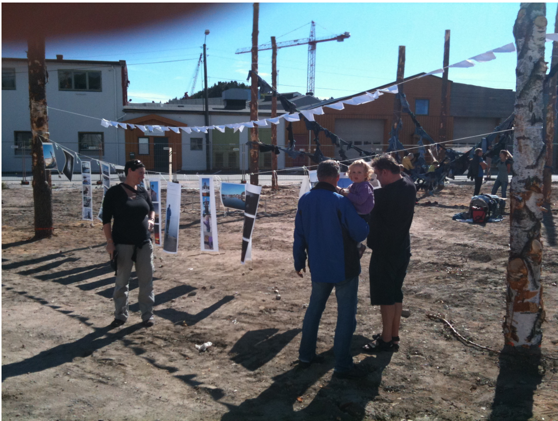
Public Foto Project Past .Present. Future