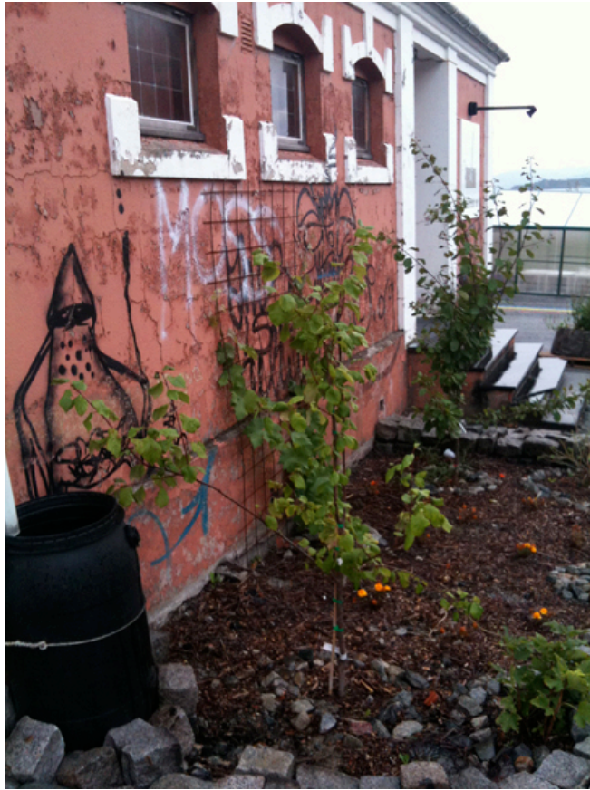
Organic Fruit Tree Garden Tou Scene